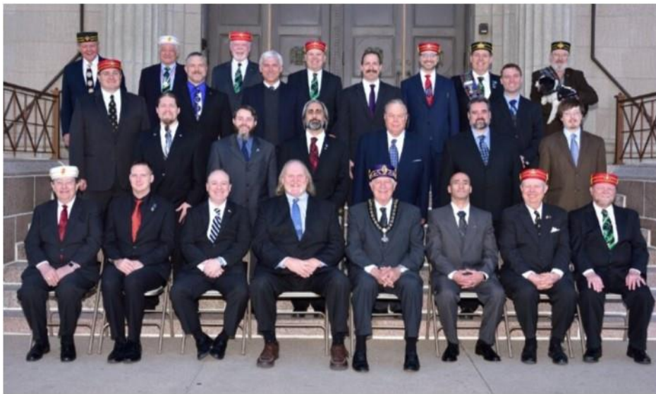
2019 Spring Class

AN OPPORTUNITY TO REUNITE WITH YOUR BROTHERS REVISIT THE TEACHINGS