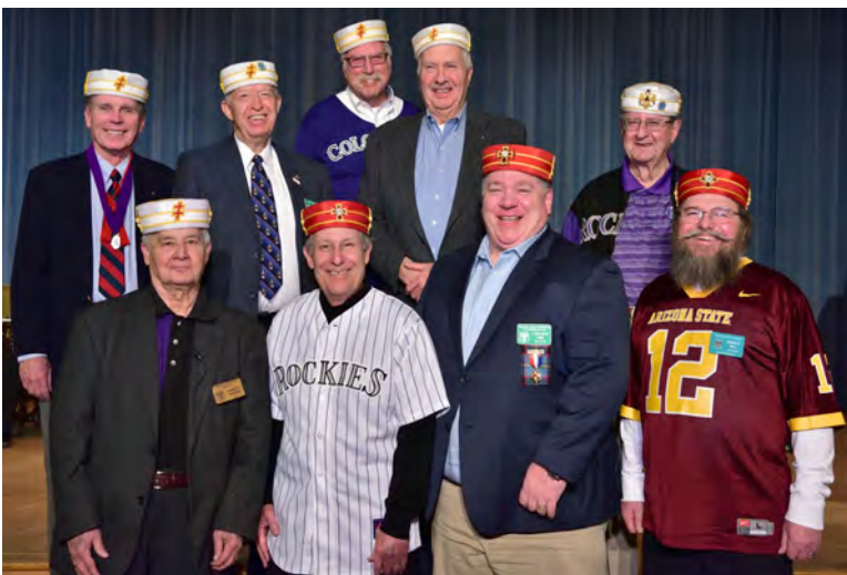
Colorado Council of Kadosh