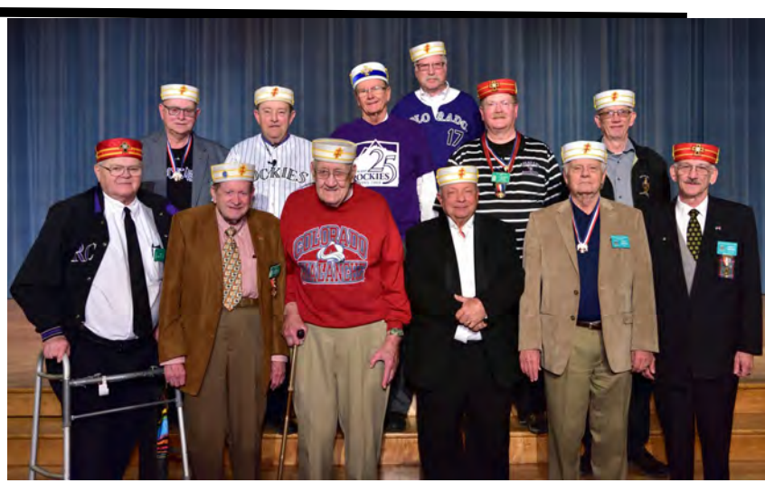
Rocky Mountain Chapter of Rose Croix