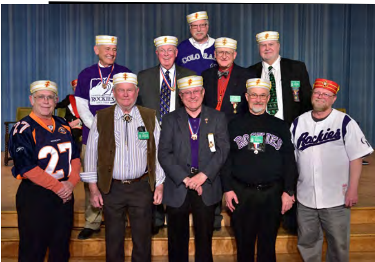
Centennial Lodge of Perfection