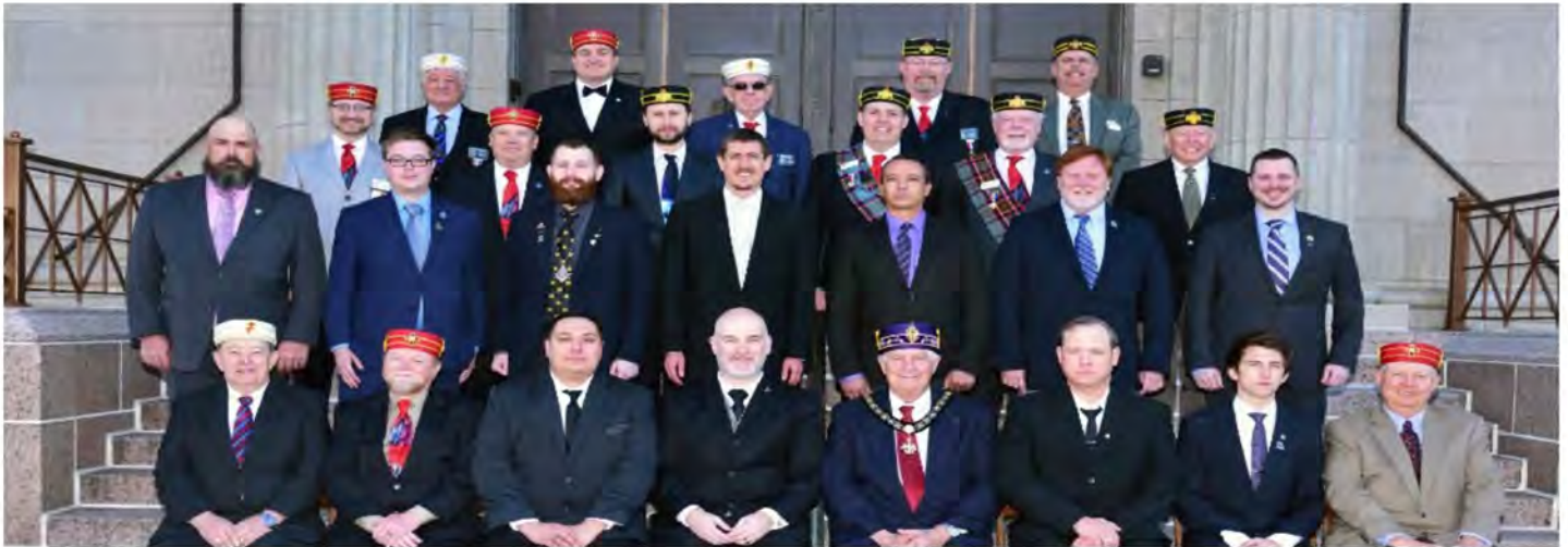
2018 Fall Class

AN OPPORTUNITY TO REUNITE WITH YOUR BROTHERS REVISIT THE TEACHINGS