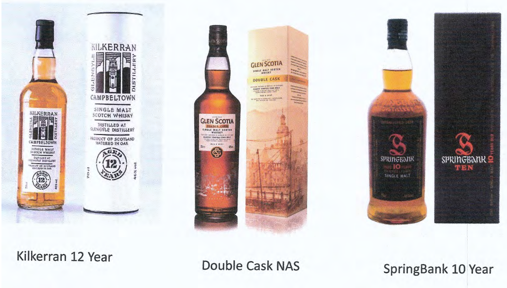
Kilkerran 12 Year