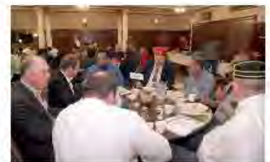
Fellowship and Fun.

First line signer incentive program. Four petitions in a calendar year will pay your membership for a year. If you are a life member then it entitles you to receive stated meeting dinners for a year.