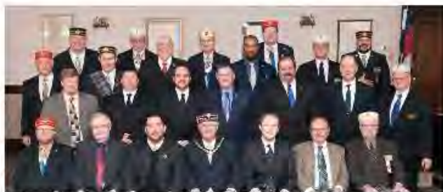
SPRING CLASS OF 2015