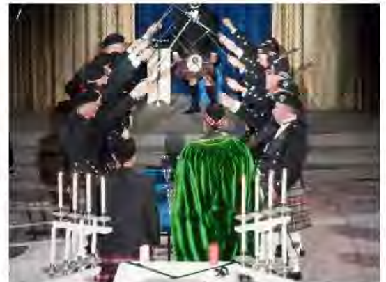
The Venerable Master is received.

SET ASIDE TIME TO REVISIT THE TEACHINGS.