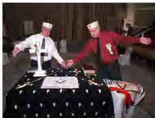
On with the performance!

First line signer incentive program. Four petitions in a calendar year will pay your membership for a year. If you are a life member then it entitles you to receive stated meeting dinners for a year.