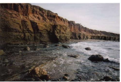
Beautiful water of Washington coast

So, it is with God. Nature shows us our G.A.O.T.U. His designs also instruct us how to live here on this planet He made. I look around and note order and not chaos. That everything grows or ages, even though we can't quite understand what causes this.