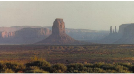
The clean air of the Four Corners

Nature can teach us a lot. It is just that we have to view, think on and listen to what it has to say. This natural philosophy, what we call what this entire topic surrounds, was the basis for all the sciences we have today. Whether it is the study of the oceans, the atmosphere, soil conservation or how the earth works within its crust.