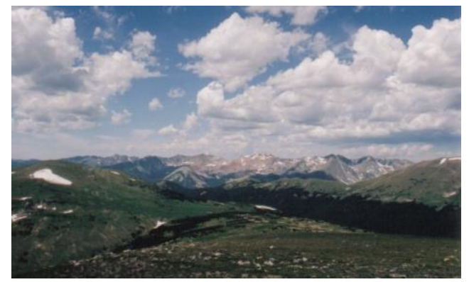
The glorious earth - Rocky Mountain National Park

Nature is something we here in Colorado can view everyday. Just look west and what do you see? This might be the starting point when speaking about this book.