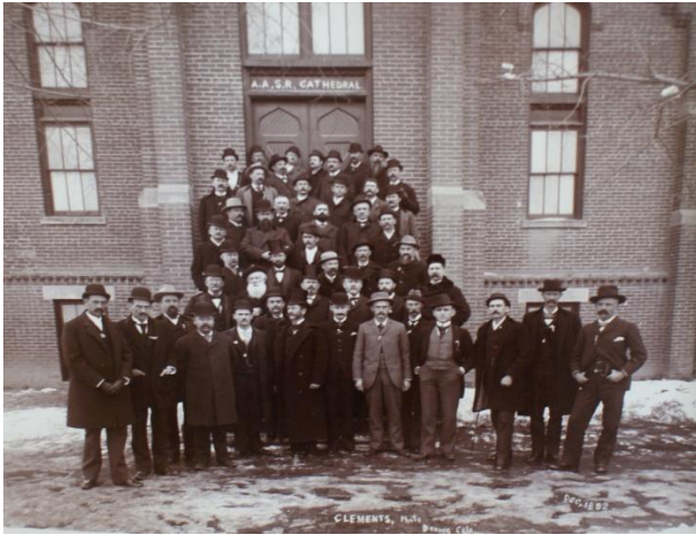
December 1892 class picture