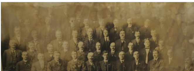
One of our damaged class pictures from 1904

A CD of the complete set also will be available for $40.00, which includes a digital picture of all the classes in our archives and some unusual patients we have.