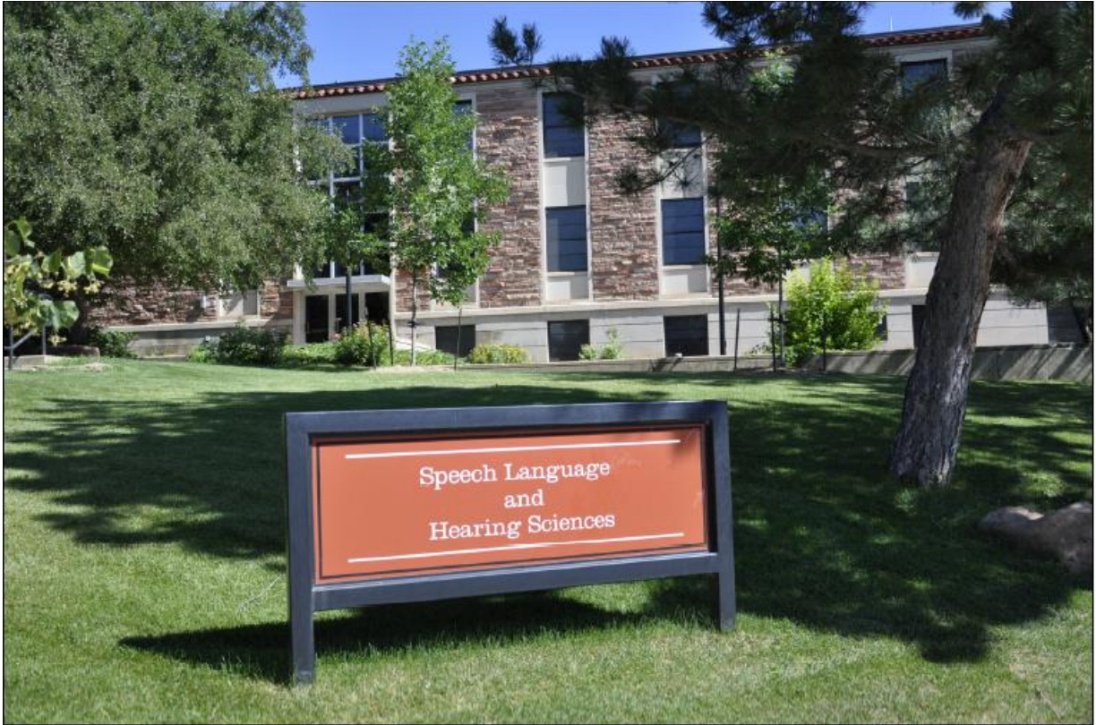
Colorado University's speech, language, and hearing departmental building on the Boulder campus