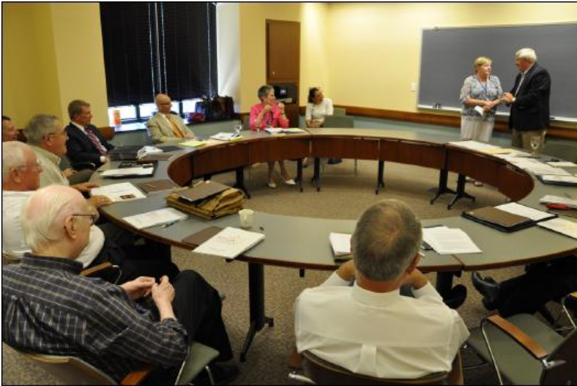
Board Meeting at the CU Law School – Boulder

September Meeting at Denver Consistory Honoring speech pathology graduate students Showing the recently released RiteCare film