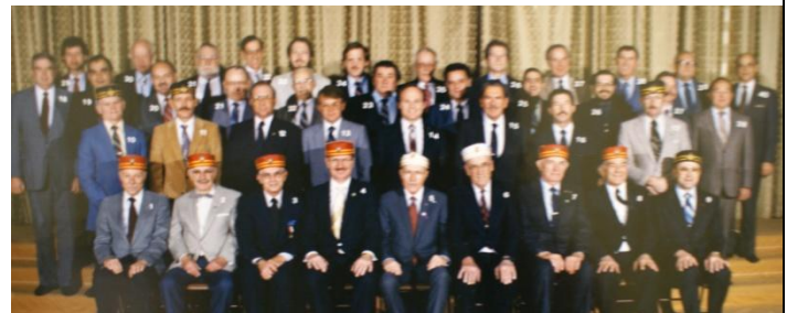
Our first color class picture! (November 1986)

We even have about a dozen bound and wrapped packages of pictures, some framed that have never seen light from the 1910s to 1930s, which we like to keep that way and preserve them for future Scottish Rite Masons to enjoy. So – take notice!