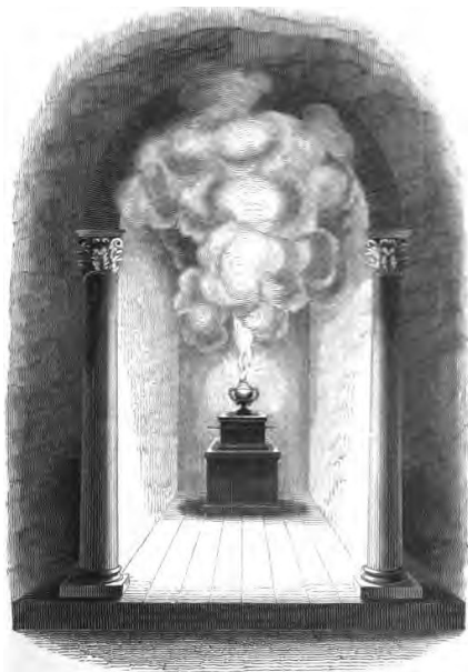
by Michael D. Moore, 32°

It was nice to see that a few of you knew the answer to last month's quiz. It was lustration – a small event we do in our ritual, which has much more to it than the time we give in thought or action. Lustration is a topic we normally shy away from since it is so close to a tradition in many churches and may have been observed in some of our lives. Masonic topics like these always seem to encroach on religion, but are actually much older than what is done in a modern church and needs to be discussed, thought upon and a proper view developed on this.