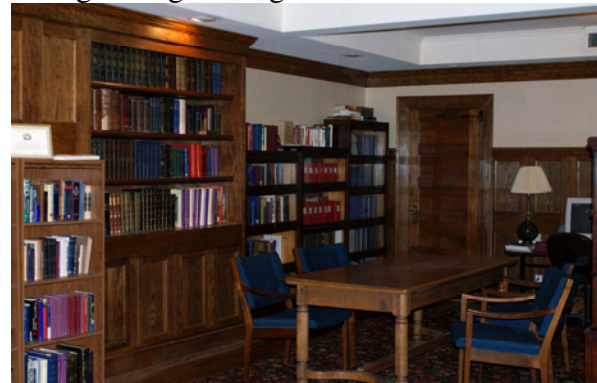
Denver Consistory's library

For Scottish Rite Masons, it symbolizes immortality of the soul. Ancient candidates were given Mimosa Nilotica , its scientific name, to hold in their hands while doing rituals since the color – green – has the symbolism connected to it of never fading through the ages.