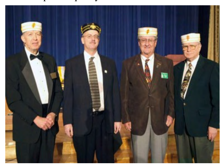
Are you committed to being a part whenever possible?

We repeat this pattern of great food, good fellowship and quality entertainment each month.