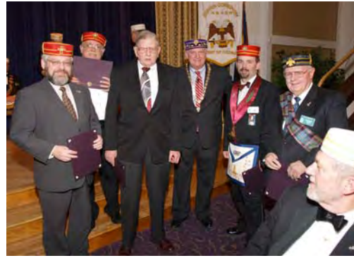
New Life Members

“God and the Square, with five or seven right and perfect Masons.”