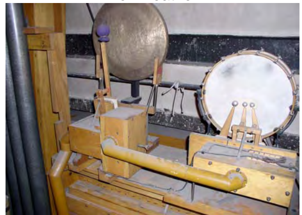
Snare Drum & Chinese Gong